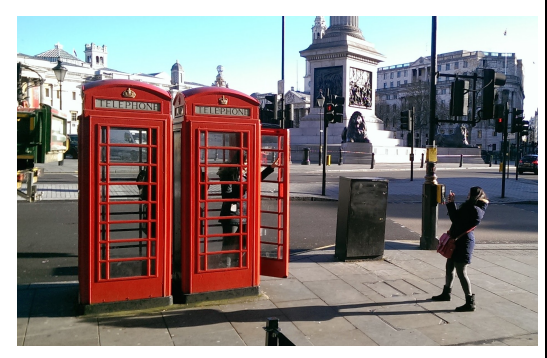
Post-flight coffee with charming tourists

The program including the conference booklet with all New Researcher papers as well as links to the regular papers are available on the website of the EHS, <a href="https://www.ehs.org.uk">www.ehs.org.uk</a>. -FP