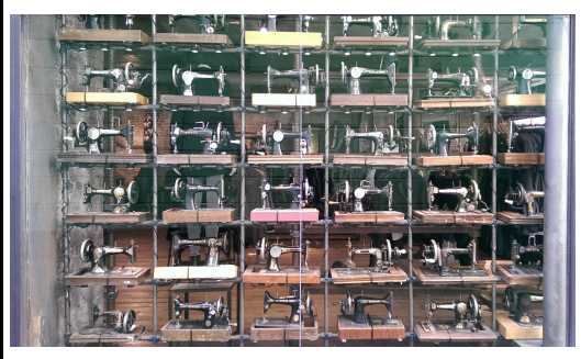
Old-school (but transformative) technology