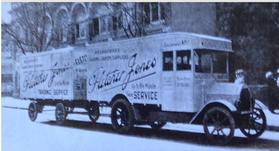
Early Days. Trucks, c. 1914-1924, 16.5x8cm. Reference no. 2012.0031, item 2012.0031.5413, Fletcher Jones Business and Family Records, University of Melbourne Archives