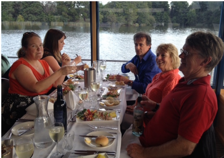
Conference attendees enjoying a scrummy dinner cruise on picturesque Lake Burley Griffin