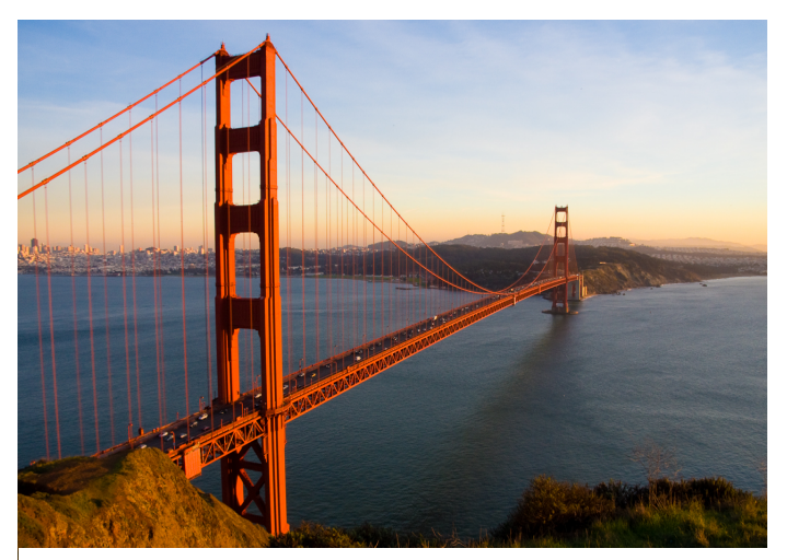
It's actually orange, but still iconic

The fourth paper, by Nuno Palma (LSE) and Andre Silva (Nova School of Business and Economics) constructed a general equilibrium model of trade between Europe and Asia during the Early Modern Period (1500 – 1800) to examine the impact of American precious metals. After calibration the model was used to estimate a counterfactual without precious metals from America, leading to the conclusion that their discovery was a major driver of Euro-American trade. (cont.)