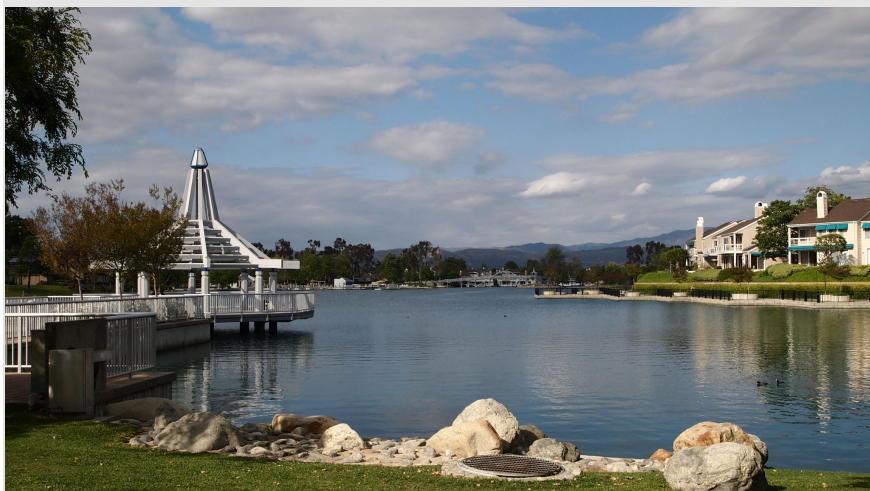
"Irvine: Home of Planned Communities"