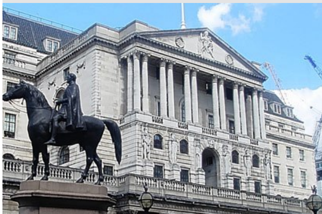
The stately entrance to the British central bank