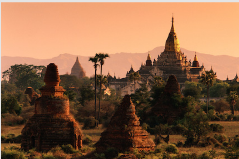
Myanmar on a good day

The CEH welcomes courtesy announcement from affiliates and interested parties for inclusion in our newsletter. Please send news to CEH.RSE@anu.edu.au (subject to editing).