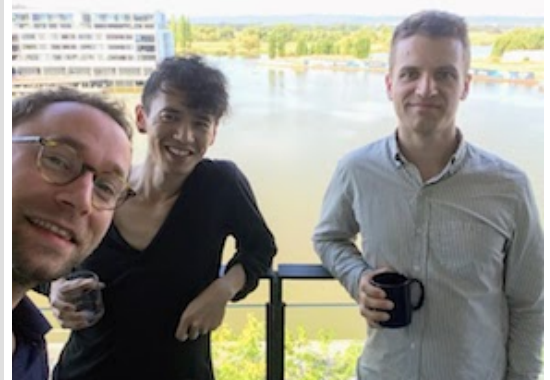
Random post conference group selfie (with strictly non-alcoholic beverages)