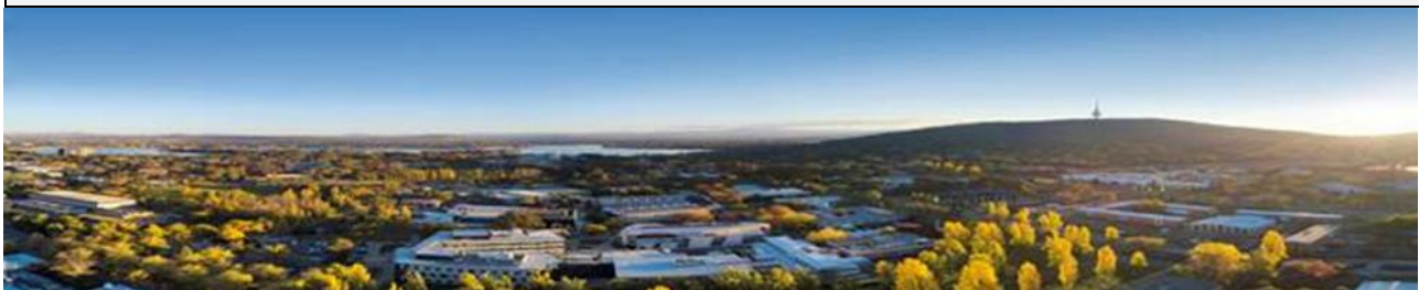
View over North Canberra, home of the ANU